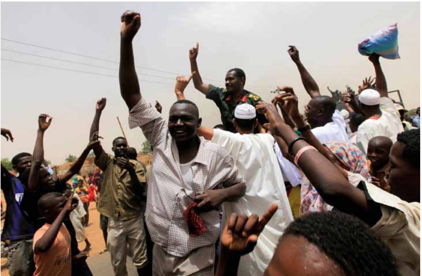
Sudanese forces and civilians celebrate after regaining control of a town controlled by the Sudan Revolutionary Front

The Sudan Revolutionary Front (SRF) is a militant coalition comprised of three Darfur-based groups, the Justice and Equality Movement (JEM), the Sudan Liberation Movement/Army - Abdel Wahid (SLM/A-Abdel Wahid) and the Sudan Liberation Movement/Army - Minni Minnawi (SLM/A-Minnawi), in addition to the Sudan People's Liberation Movement/Army - North (SPLM/A-North), which is based in the South of the country. The coalition primarily operates across Darfur, and the Southern states of South Kordofan and Blue Nile, which border South Sudan. The SRF was formed on 12 November 2011, with the objective of overthrowing President Omar al-Bashir and his National Congress Party (NCP) Government through "popular and military means", and establishing a secular democratic state.