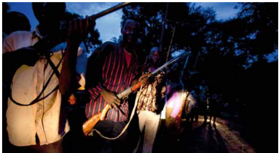
Members of a self-defence group stand guard against attacks from the Lord's Resistance Army

objective is that of survival, with only small groups of militants scattered throughout the cross-border region between Uganda, the DRC, Sudan, and the CAR. Nevertheless, it retains some low-level capability and the intent to continue attacking civilian targets, as it demonstrated by the continuation of sporadic attacks in the DRC, CAR, and South Sudan since 2012.