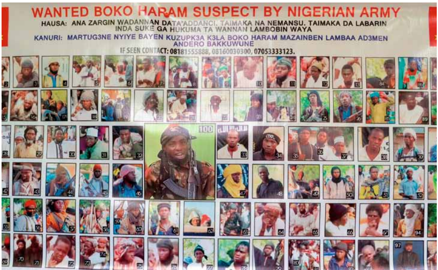
A poster in Maiduguri showing Boko Haram suspects wanted by the Nigerian army

Jamaat Ahl al-Sunna li Dawa wal-Jihad, better known as Boko Haram, is a militant Islamist group fighting for the implementation of sharia (Islamic law) in Nigeria, and is primarily active in the Northern states of Borno, Yobe, Adamawa, Kano, Bauchi, and Kaduna. The group's origins lie in the Yusufiyya Islamist movement established in Borno in the early 2000s by Mohammed Yusuf, a radical young cleric. Following mounting harassment by the security forces, the mainstream Yusufiyya movement led by Yusuf launched an uprising along with the Nigerian Taliban in July 2009. While this was crushed, the group re-emerged as a series of local factions under the nominal leadership of Imam Abubakar bin Mohammed (alias Abubakar Shekau) and launched a guerrilla campaign in late 2010. In the subsequent