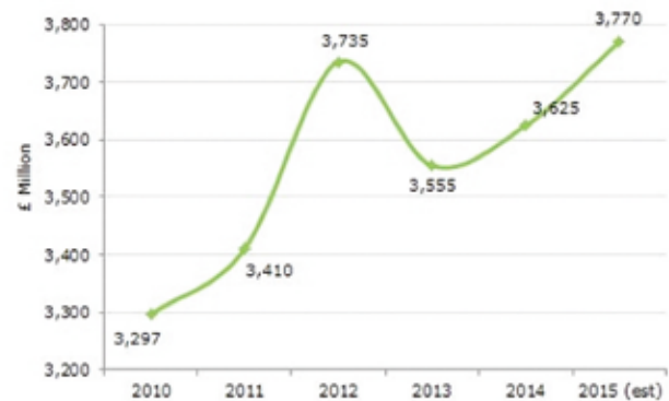
UK market for manned security, 2010-14

Real-term growth of six percent is forecast for 2016, but this masks continuing challenging trading conditions for most operators. The fruits of growth will not be evenly distributed among firms, and smaller companies are expected to struggle as revenues from the commercial and business sectors stabilise rather than increase. Wider economic growth and modestly rising revenues from the commercial sector will provide some forward momentum for the manned guarding