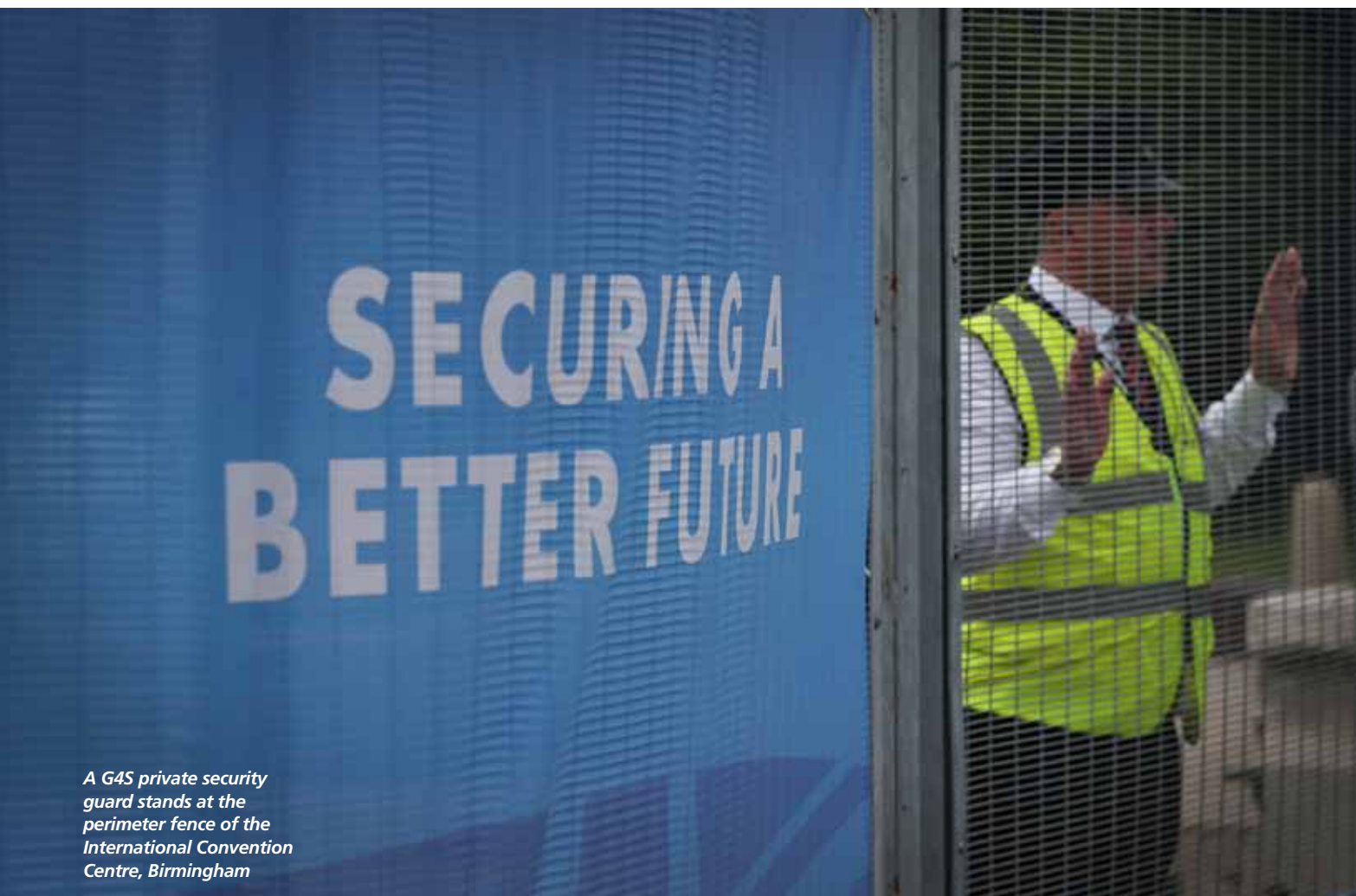
A G4S private security guard stands at the perimeter fence of the International Convention Centre, Birmingham