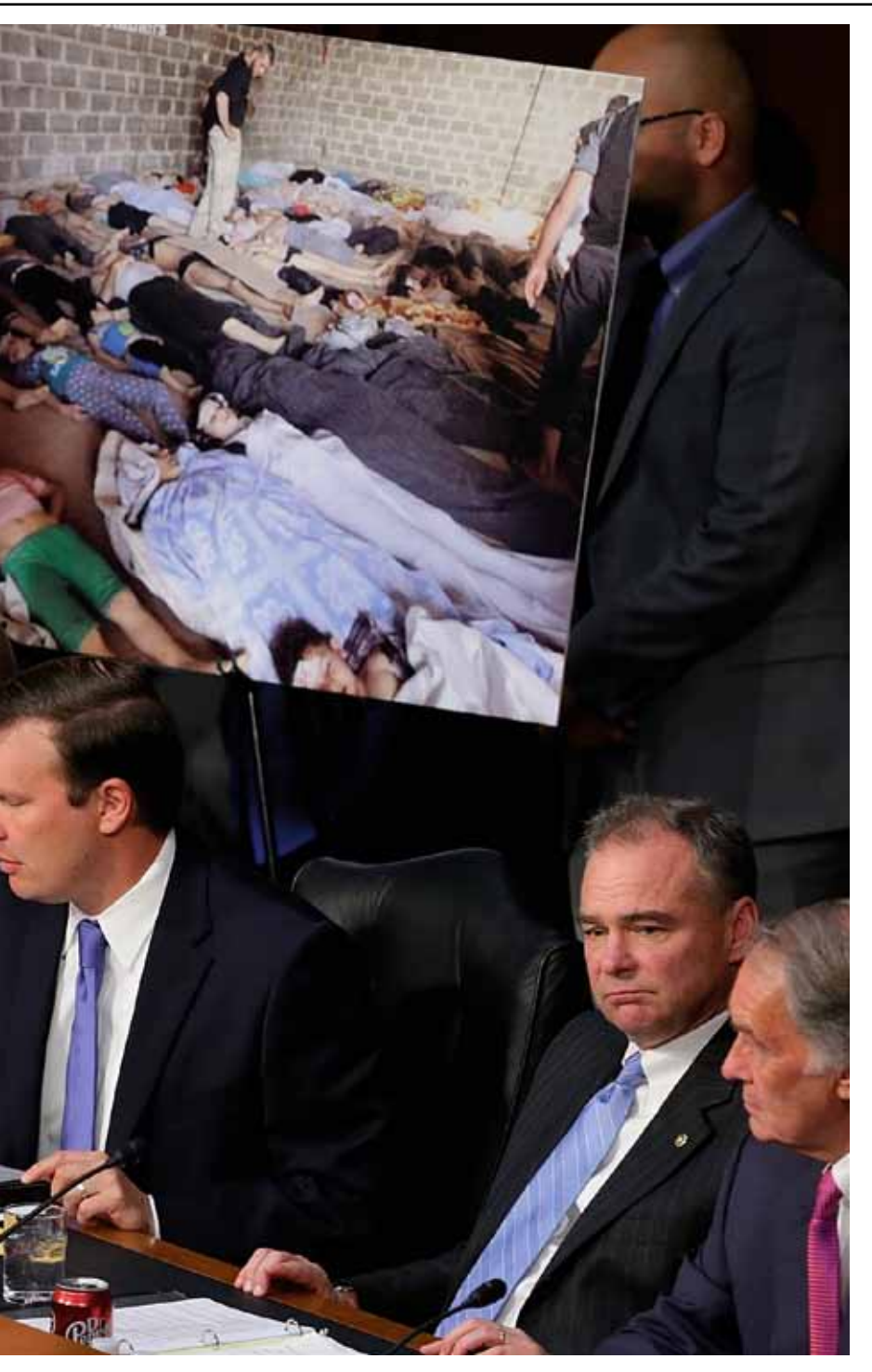
US senators examine pictures of the alleged victims of Assad's chemical weapons

the West effectively on its doorstep. Hot on the heels of collapse from superpower to also-ran, the imminence of Western military, then cultural and economic advances into the original Cold War buffer zone have placed the Kremlin on the back foot in Europe for years. Adventures in Belorussia, Moldova, Trans-Dniester and Ukraine could be seen as an attempt to maintain that cordon sanitaire, with the Kremlin more than prepared to influence these countries to keep them away from the threats posed by the West.